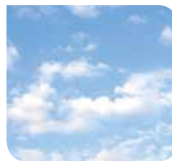
Low maintenance glass

How does it work? There are two processes. Firstly, the special coating harnesses the natural daylight which triggers the breakdown of the dirt and grime on the outside of the glass and secondly, when the rainwater hits the glass, rather than forming droplets,