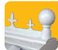
Ball finial & Shield cresting